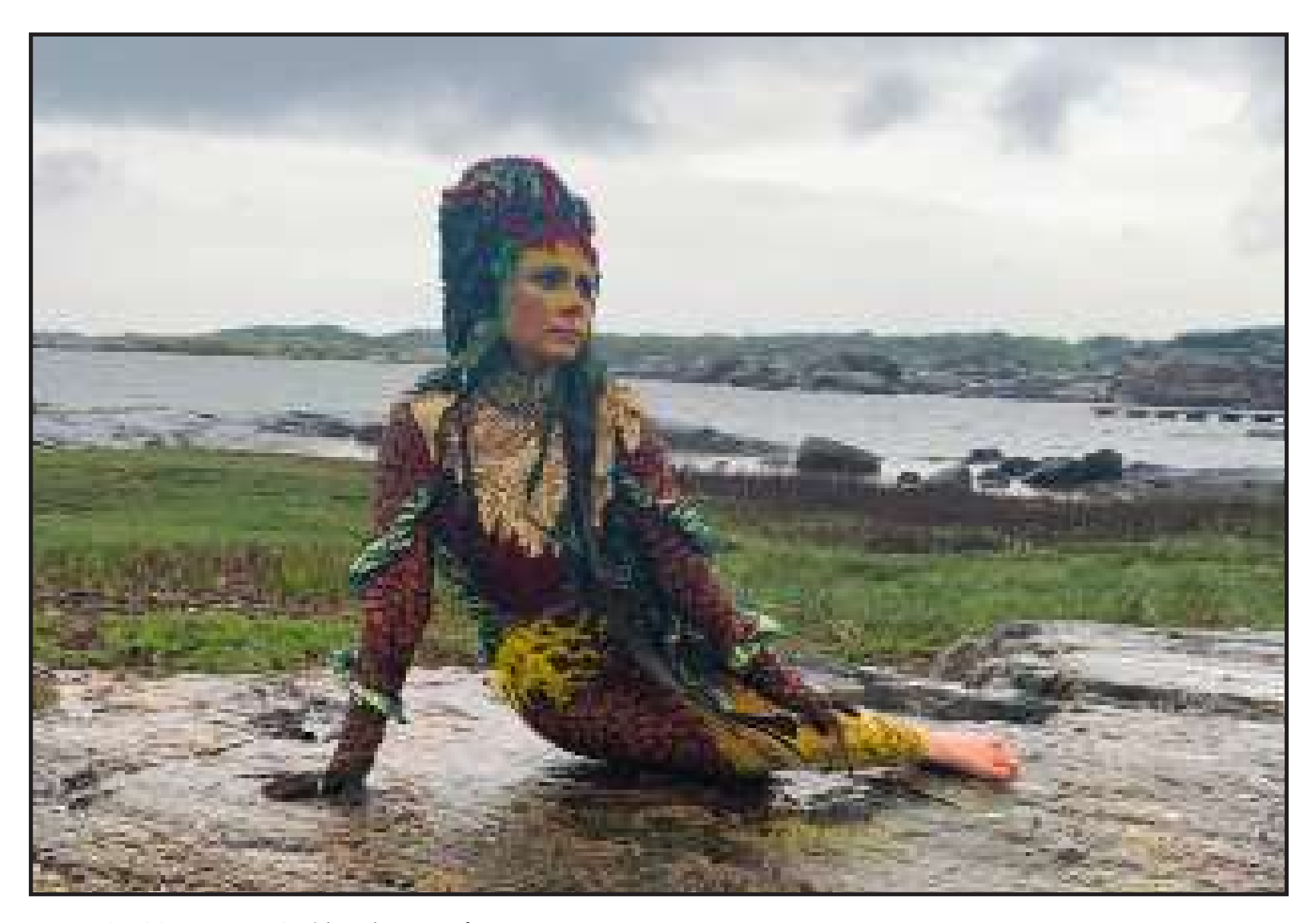
BIRTH OF GOTHENBURG , video-danse performance. 400 years birthhday in collaboration with Collective Moves, and original idea from Isabel Lagos, choreographer: Sebastian Bartilson, HÖno island, Sweden, 2020.