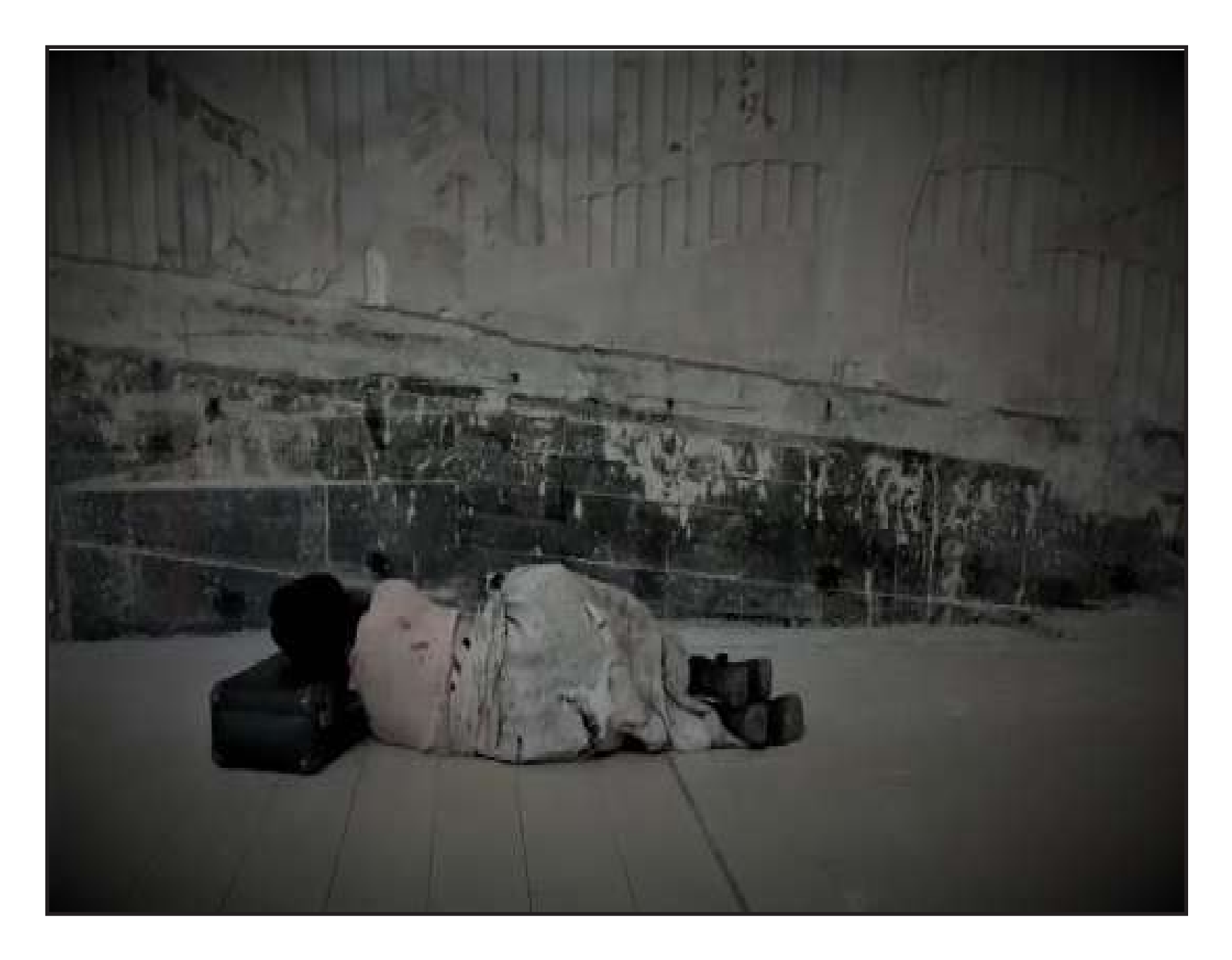
PIRATES FROM THE FUTUR, 2021 . Film by kollectif Revange, Sweden.