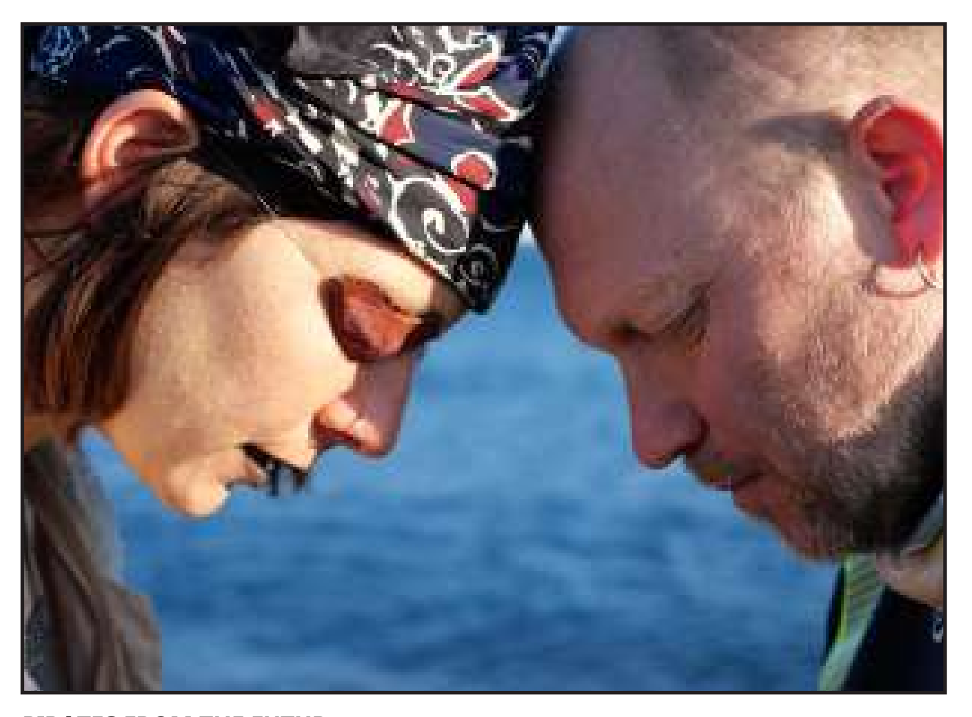
PIRATES FROM THE FUTUR, 2021 , Film by kollectif Revange in collaboration with GAO (Gothenburg Alternativ Orchestra), Sweden.